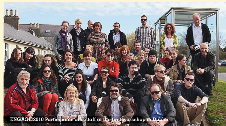
ENGAGE 2010 Participants and staff at the first workshop in Dublin