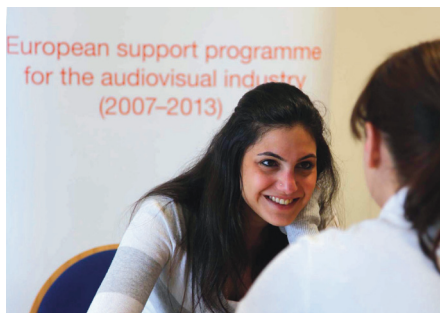
Participants get to hear about each other's projects

Panel discussion: European co-production: Baltic countries and beyond