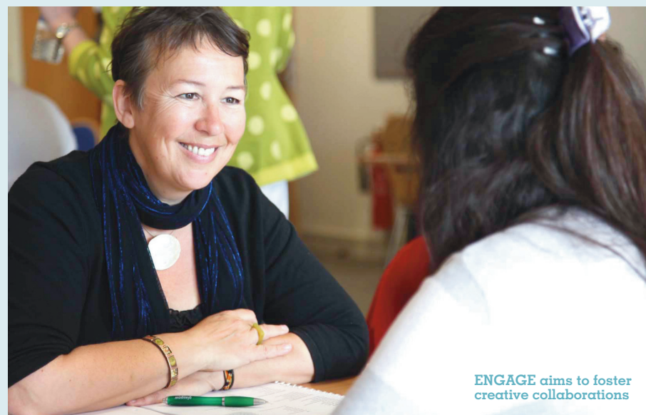
ENGAGE aims to foster creative collaborations

Aalto University's School of Art and Design in Helsinki, Finland has been a leader in art and design education for over 138 years. Housing the Department of Motion Picture, Television and Production Design, it is an international postgraduate university institution with students from over 50 countries. The university offers Doctorate, Masters and Bachelor degrees in a wide range of disciplines, including fine art, design, new media, art education, visual culture, motion picture and production design. The school is a pioneer in research and in developing interdisciplinary study programmes.