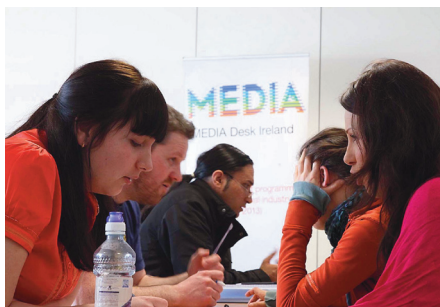
An ENGAGE workshop in action